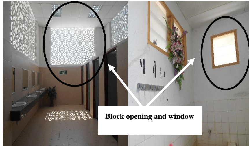
Figure 1. Well-built ventilation

overall users because the disparity of the level of awareness among community members or the users. Ramli (2017) interviewed a few water closet users in mosques, and the answers showed a lack of consensus. In essence, general facilities should include water closet separation, water closet area, signage, water closet unit, floor condition, common facilities, light level, ventilation and parental section. A parental section should be provided to help users ensure the cleanliness of their child before entering the main prayer hall. However, none of the mosques provided it. By contrast, ventilation was present in all the selected mosques. As shown in Figure 1, windows and block openings on walls provided sufficient ventilation.