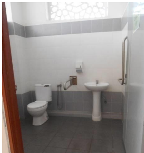
Figure 6. Condition of the water closet for the disabled

The water closet for the disabled was considered insufficient in this study because four of the selected mosques did not provide facilities. This finding is consistent with the assertion of Aman et al. (2017) that most designers neglect ancillary components, such as water closet and ablution area, and these components are inaccessible to unable-bodied users, such as the disabled, elderly and children. Only one out of five mosques selected met this criterion (Figure 6). The elements were sufficient, even though signage and tissue paper dispenser were not provided.