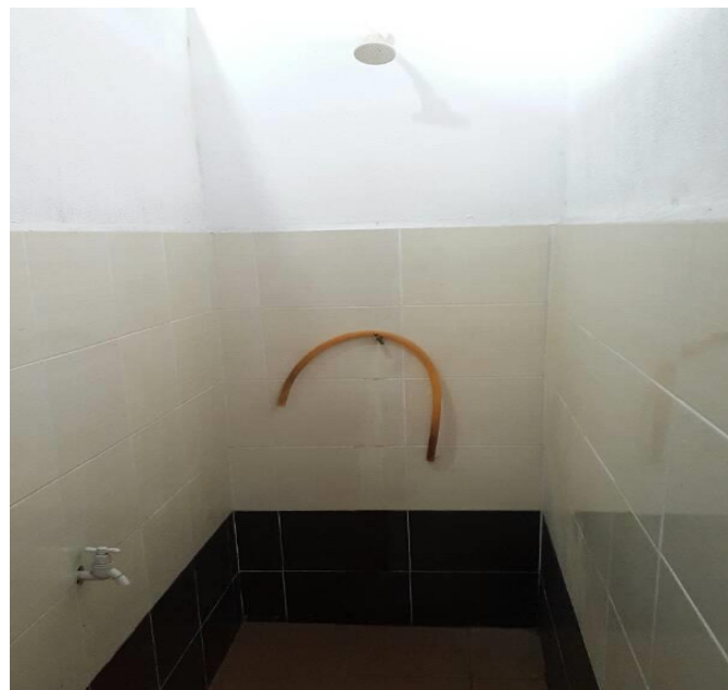
Figure 4. Shower conditions in one of the selected mosque.

The shower area is another important criterion of water closet facilities. According to MS2015: Part1: 2006, a shower should be provided to meet the expected demand. However, two out of five did not have such a provision. Furthermore, a shower area should have sufficient facilities, such as robe hooks, foldable seat; grab rails, shower head and soap dispenser. None of the selected mosques provided grab rails and foldable seats. Figure 4 shows the shower conditions in half of the selected mosques that did not have foldable seats, grab rails and soap dispensers.