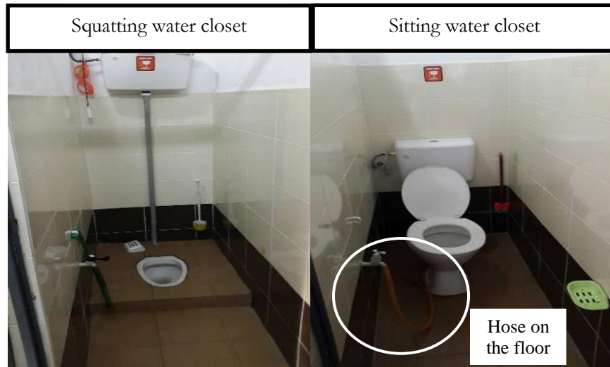
Figure 5. Different type of Water closet cubical

The water closet cubicle and water closet for the disabled are classified as self-containing fully enclosed spaces for defaecation and urination. According to MS 2015: Part 1: 2006, the water closet cubicle and water closet for the disabled should contain sufficient sanitary fixtures and elements because these facilities are important in maintaining a hygienic environment. Difficulties in accessing and using these facilities are a major issue, especially for the disabled, elderly and children. Water closet cubicles should have sufficient elements, including water closet cubicle area, door, floor condition, robe hooks, water closet bowl, water tap, tissue roll holder, trap floor, flush tank and sanitary disposal unit, each of which should comply with national standards, guidelines and legislation. However, the water closet cubicles in the selected mosques were of moderate condition, and none of the mosques provided a sanitary disposal unit either in the water closets for males or females. Figure 5 shows the condition of the water closet cubicles in the mosques.