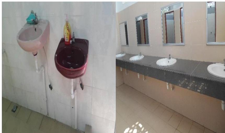
Figure 2. Types of wash-hand basins and a wash-hand basin for children

With regard to wash-hand basins, all mosques had moderate-condition wash-hand basins, and none of the elements was ignored. Two types of wash-hand basins were used in all of the selected mosque i.e. isolated or connected by bench. Figure 2 shows the different types of wash-hand basins. The wash-hand basins did not fully comply with the following requirements stipulated in national standards, guidelines and legislation: the number of basins should be equal to the number of water closets provided, the height of the top basin must be 700–800 mm, the height of the lower basin should be 550 mm, the width of the basin must be 600 mm, the minimum height of the core end skirting must be 100 mm, the distance from the centres of adjacent basins should be 850 mm, a wash-hand basin for children should be provided, and the basins should have chromed brass P traps without a waste plug.