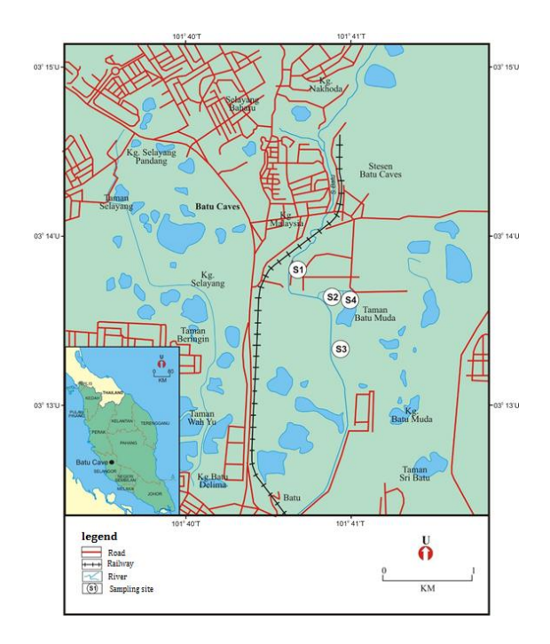
Figure 3. Spring Crest Industrial Area, Batu Caves