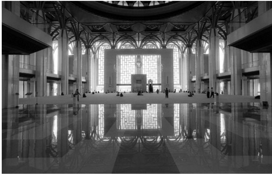
Figure 2: The interior space of prayer hall that just use the natural daylight for a day.