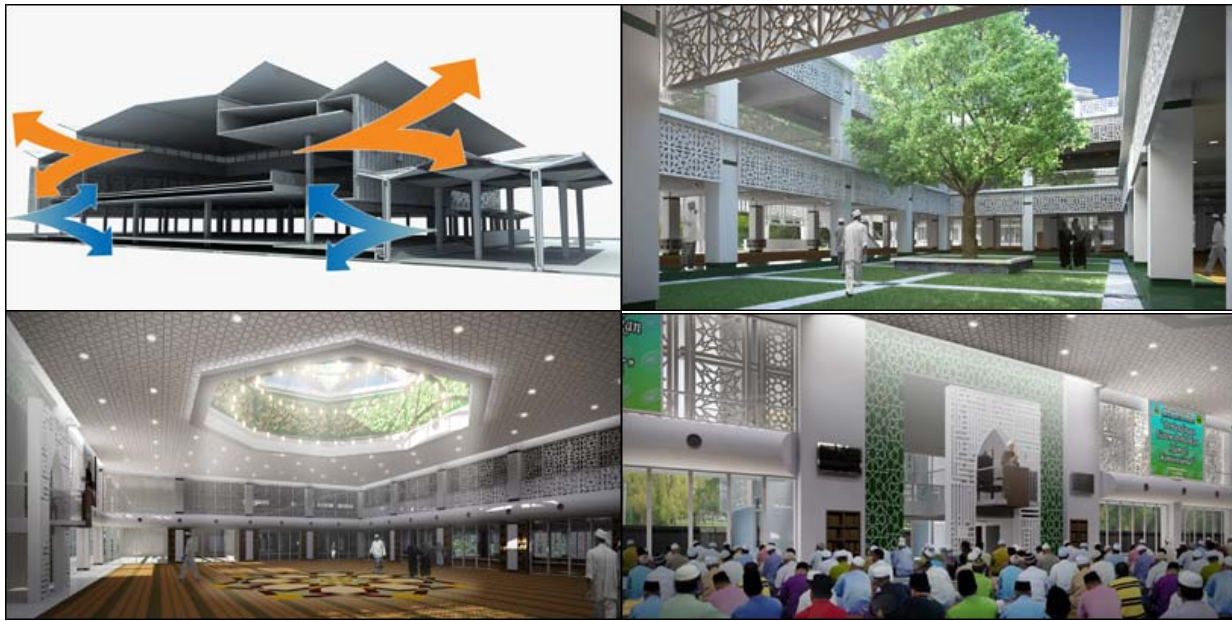
Figure 4: The natural ventilation and visual of natural day-lighting for Cyberjaya mosque