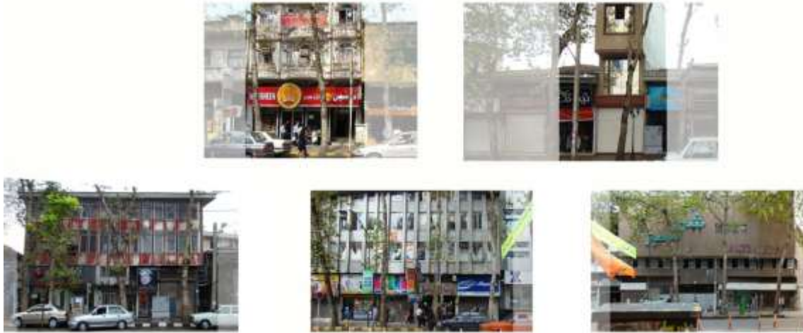
Fig5. Historical building facade with lowest mean

The result showed that the correlation between scenes were almost positive with architectural elements except with brightness for scene no 11. Accurately, there is correlation between the evaluation of scene no 6 ( r=0.12 , p<0.01 ), scene no 7 ( r=0.170 , p=0.012 ) and facade architectural style, design and shape, scene no 15 ( r=0.138 , p<0.05 ) and facade decoration. In addition, the table showed there is about 90% significant correlation between scene no.7 ( r=0.116 , p=0.07 ) and facade color, scene no.11 ( r=0.102 , p=0.09 ) and harmony of modernity's design, scene no.11 ( r=-0.111 , p=0.08 ) and brightness. The result indicated the facade design having strongest and modernity have weakest correlation with facade with highest mean. In fact, there are architectural elements, which influence the evaluation of the historical facades. Future more, the impression of architectural style is agree with some previous result as (Askari,2009) mentioned it , (Nasar, 1989: stamps III,1991,Karaman,200; Hui,2007) and It showed that, the design, and facade decoration, (frewald, 1990), and details and context (Akalin, et al., 2009) may influence quality evaluation. Architectural style (Nasar, 1989 and Hui, 2007), age of the building and shape ,color (Swirnoff, 1982; Hui, 2007) are other factors, which accepted as important factors in evaluation of facades by research.