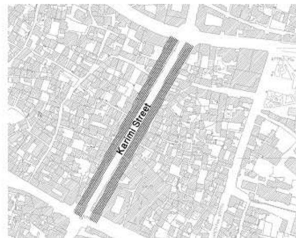
Fig 3. Karimi street Located in Lahijan historical area