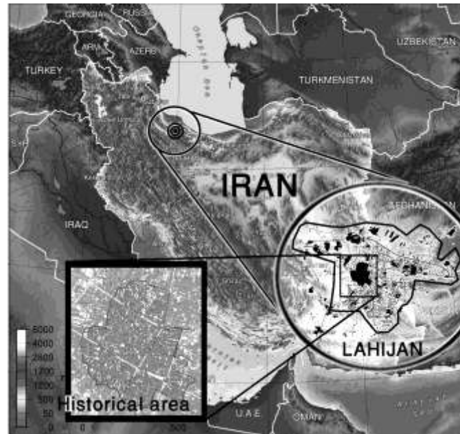
Fig2. Study area and location in North of Iran

Historical area is laid on most Iran cities as well as other cities in other countries. Building's facades at Karimi Street in Lahijan city, located at historical area, was studied as place, where have various architectural samples as modern and traditional style.