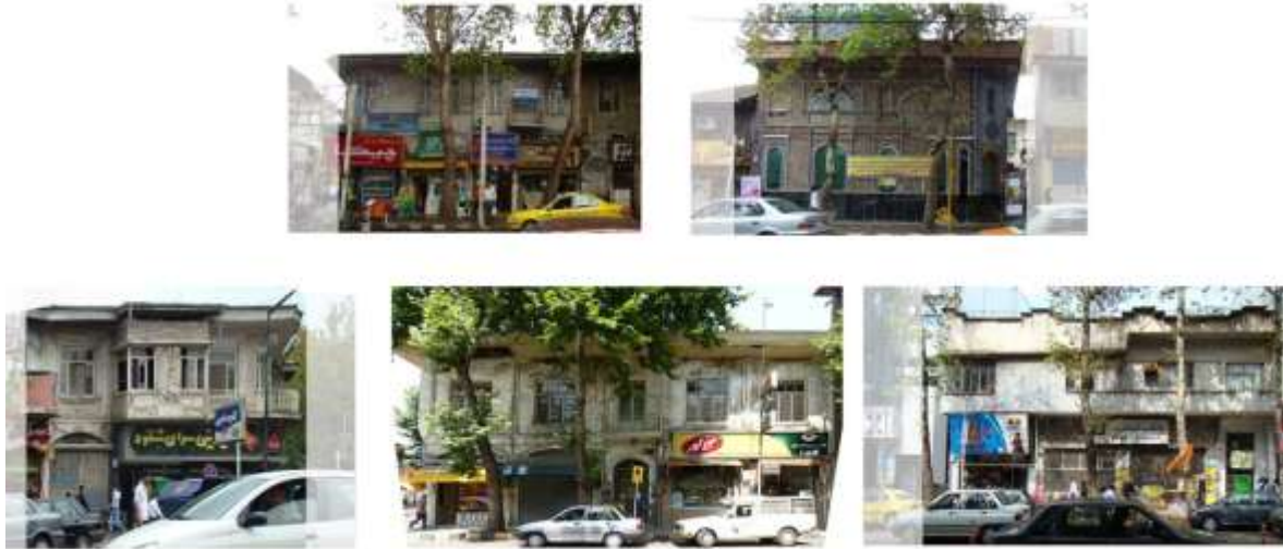
Fig4. Historical building facade with highest mean